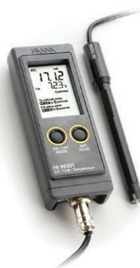
PCM Conductivity Meter