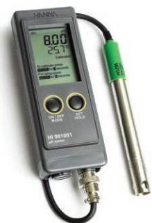
PPHM pH Meter

Handheld meters to read pH and Conductivity, suitable for use with our products. Ensures consistent monitoring of treatment solution.